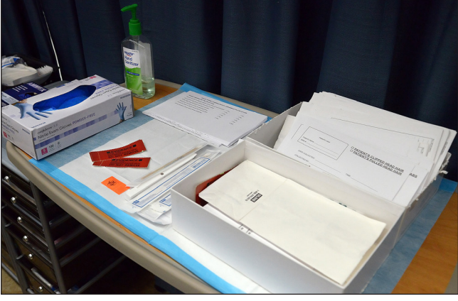
An evidence collection kit sits on a table.